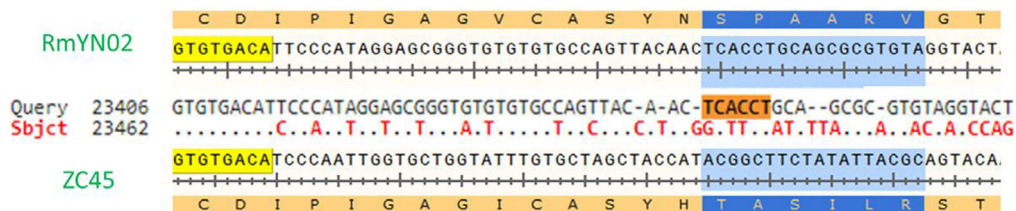
FIGURE 2 Alignment of nucleotide and amino acid sequences of the S protein from bat-SL-CoVZC45 (MG772933.1) and RmYN02 at the S1/S2 junction site. No insertions of nucleotides possibly evolving in a furin cleavage site can be observed (in blue)

spike protein of SARS-CoV-2 of a cleavage site activated by a host-cell enzyme furin, previously not identified in other beta-CoVs of lineage b [36] and similar to that of Middle East respiratory syndrome (MERS) coronavirus. [35] Host protease processing plays a pivotal role as a species and tissue barrier and engineering of the cleavage sites of CoV spike proteins modifies virus tropism and virulence. [37] The ubiquitous expression of furin in different organs and tissues have conferred to SARS-CoV-2 the ability to infect organs usually invulnerable to other CoVs, leading to systemic infection in the body. [38] Cell-cultured SARS-CoV-2 that was missing the above-mentioned cleavage site caused attenuated symptoms in infected hamsters, [39] and mutagenesis studies have confirmed that the polybasic furin site is essential for SARS-CoV-2's ability to infect human lung cells. [40]